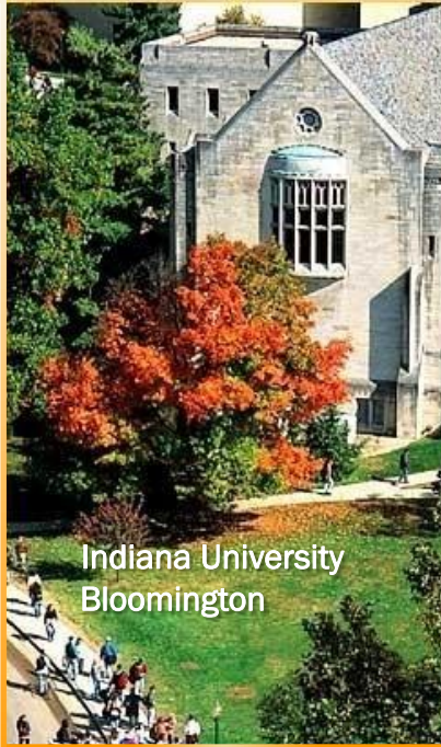
Indiana University Bloomington