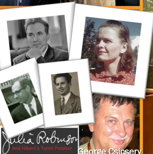
Julia Robinson And Hilbert's Tenth Problem