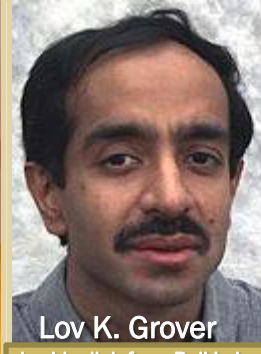
Lov K. Grover