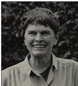
Above: Still shots from the Julia Robinson movie. Top to bottom: Julia at 3, as a young woman, and shortly before her death.