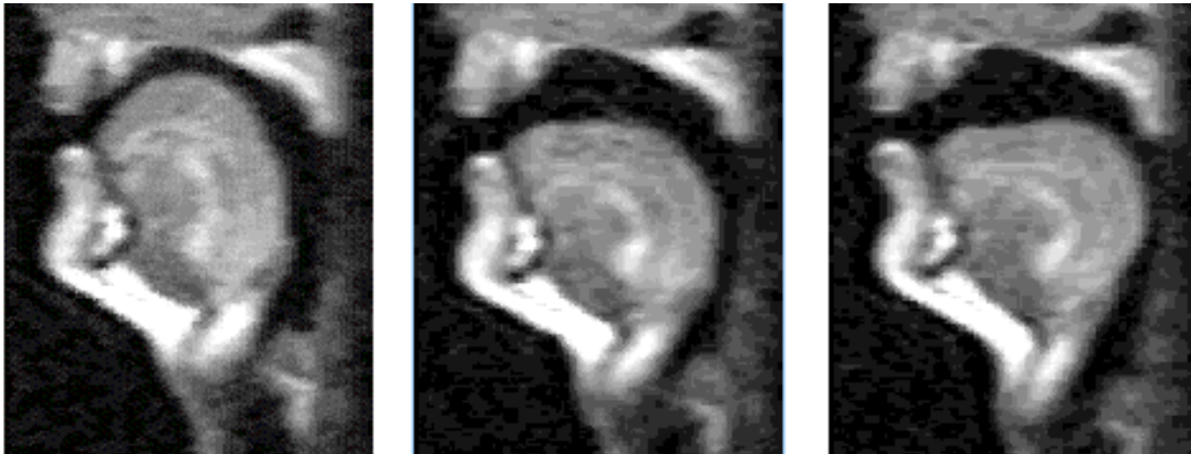
Figure 2. Three frames from an MRI movie of the vowels of French.

Most people also overlook the next most obvious form of description, an x-ray or MRI movie, comprised of frames as in Figure 2. This is not quite as good a description as a waveform— one cannot reconstruct the complete sounds just from these MRI data. But it is not hard to envisage ways in which this description could be elaborated by the addition of physiological data so that it would form a reasonably complete description of the sounds of English.