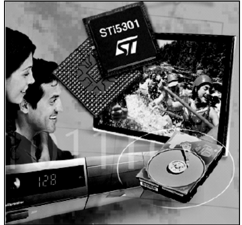
Figure 1. STi5301 low-cost interactive set-top box