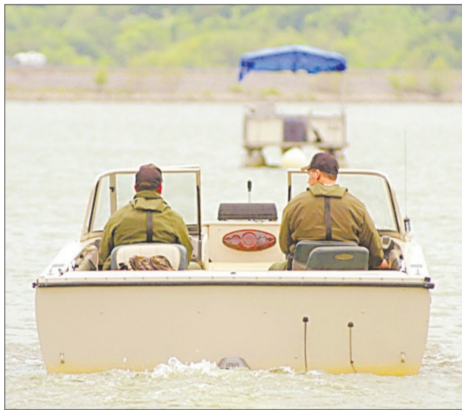
Conservation officers patrol Lake Monroe in this photo from 2005.

is intoxicated, the boater is transported back to the conservation office, where they will undergo a breath-test as well as the standard field sobriety testing, which includes standing on one leg and the heel-to-toe walk and turn.